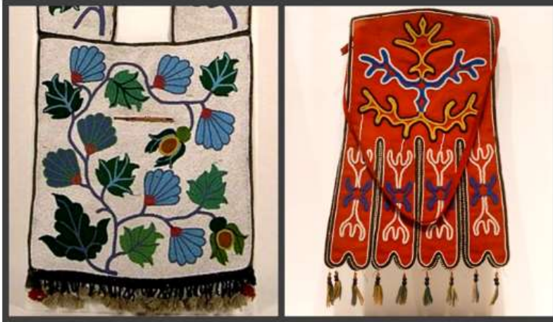
(Photo: an Ojibwe Bandolier bag (left) and a Tlingit Octopus bag via Wikimedia C/C)