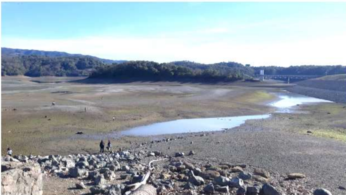
Looking from the south parking lot to the 'island' with Coyote Dam on right.